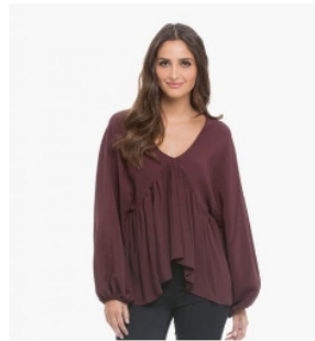
Long Sleeve Loose Top $70.00