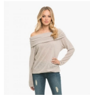
Long Sleeve One Side Off Shoulder T-Shirts $50.00