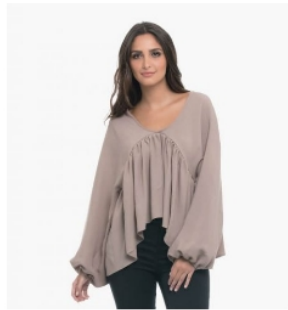
Long Sleeve Crop Top $100.00