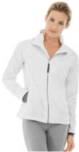
Ingrid Running Jacket