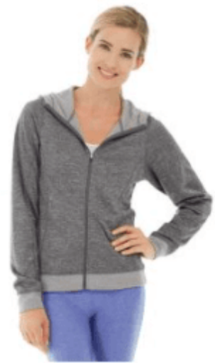
Helena Hooded Fleece