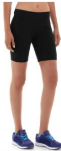
Echo Fit Compression Short