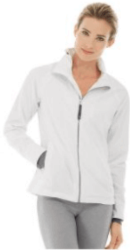
Ingrid Running Jacket