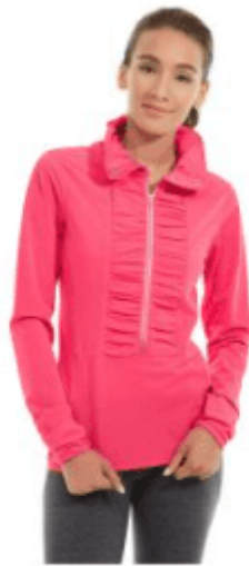
Stellar Solar Jacket