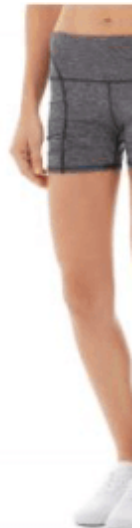
Gwen Drawstr Short