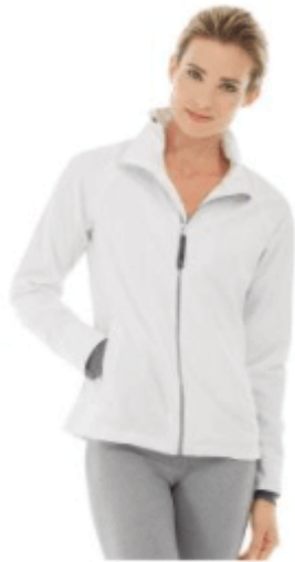
Ingrid Running Jacket